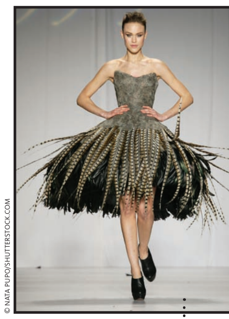
Why do female models make more money than male models?

However, before we delve into the details and models of economics, it is important that we present an overview of how economists approach problems—their methodology. How does an economist apply the logic of science to approach a problem? And what are the pitfalls that economists should avoid in economic thinking? We also discuss why economists disagree.