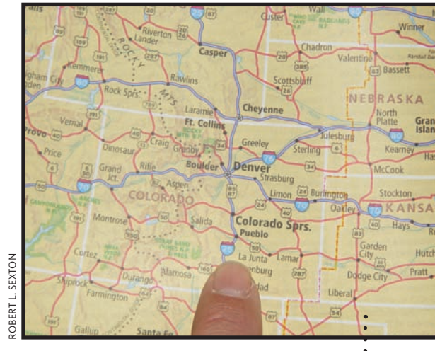
How is economic theory like a map? Much like a road map, economic theory is more useful when it ignores details that are not relevant to the questions that are being investigated.

To determine whether our hypothesis is valid, we must engage in empirical analysis. That is, we must examine the data to see whether our hypothesis fits well with the facts. If the hypothesis is consistent