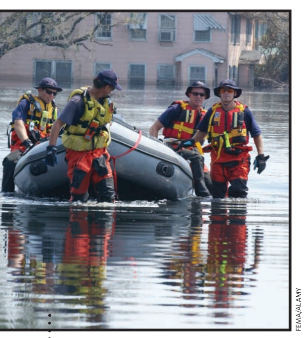
Enormous amounts of resources (time and money) were donated to the Hurricane Katrina victims. If individuals are acting to promote the things that interest them, are these self-interested acts necessarily selfish?

people do—their actions. We largely leave what people think to psychologists and sociologists.