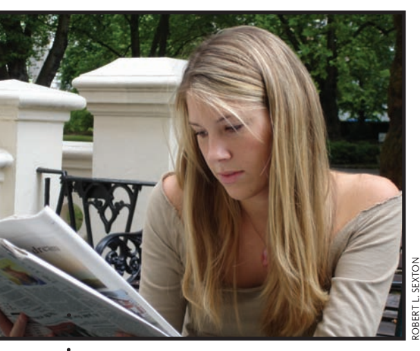
Newspapers and websites are filled with articles related to economics—either directly or indirectly. News headlines may cover topics such as unemployment, deficits, financial markets, health care, Social Security, energy issues, war, global warming, and so on.